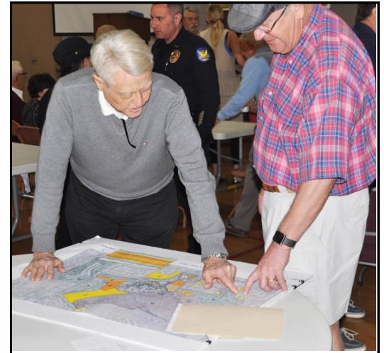
Neighbors reviewing plans for the Phoenician