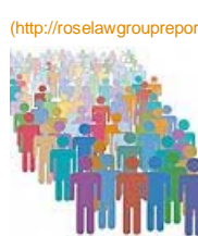
How big will the West Valley grow?