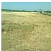
Land is holding homebuilding back