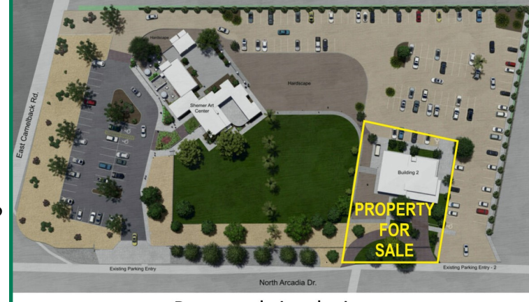
Proposed site design. (Current site wraps around property for sale.)

Potential donors are anticipated to be residents of the Arcadia neighborhood, who have a connection with this unique gem and want to help continue its legacy and be forever recognized for supporting it. Donors might also include families interested in honoring someone through naming rights to one of the art galleries or studios, or who are interested in being on our donor wall, or just want to be part of our art and sculpture designs on the new grounds.